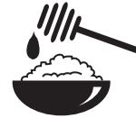
Oatmeal, Milk & Honey